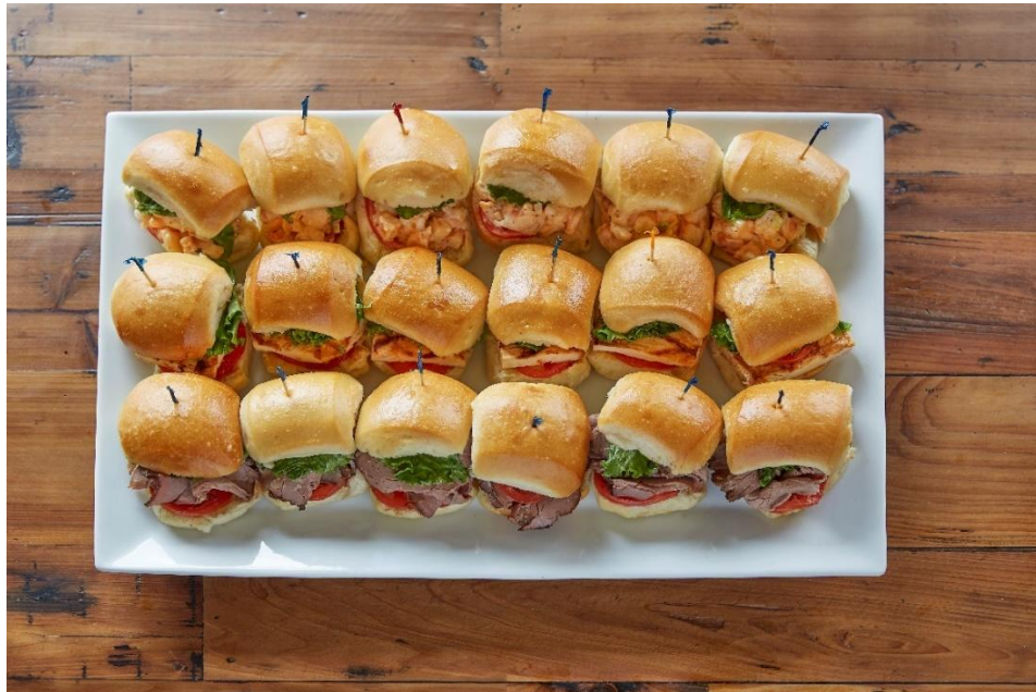
Mini Sandwich Tray

Swiss ☺ Provolone ☺ American ☺ Munster ☺ Smoked Gouda ☺ Brie...add $1.50 ☺ Avocado