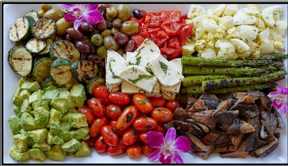
Grilled Vegetable Platter