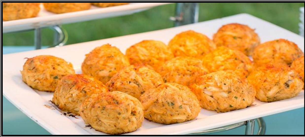
Maryland Jumbo Lump Crab Cake