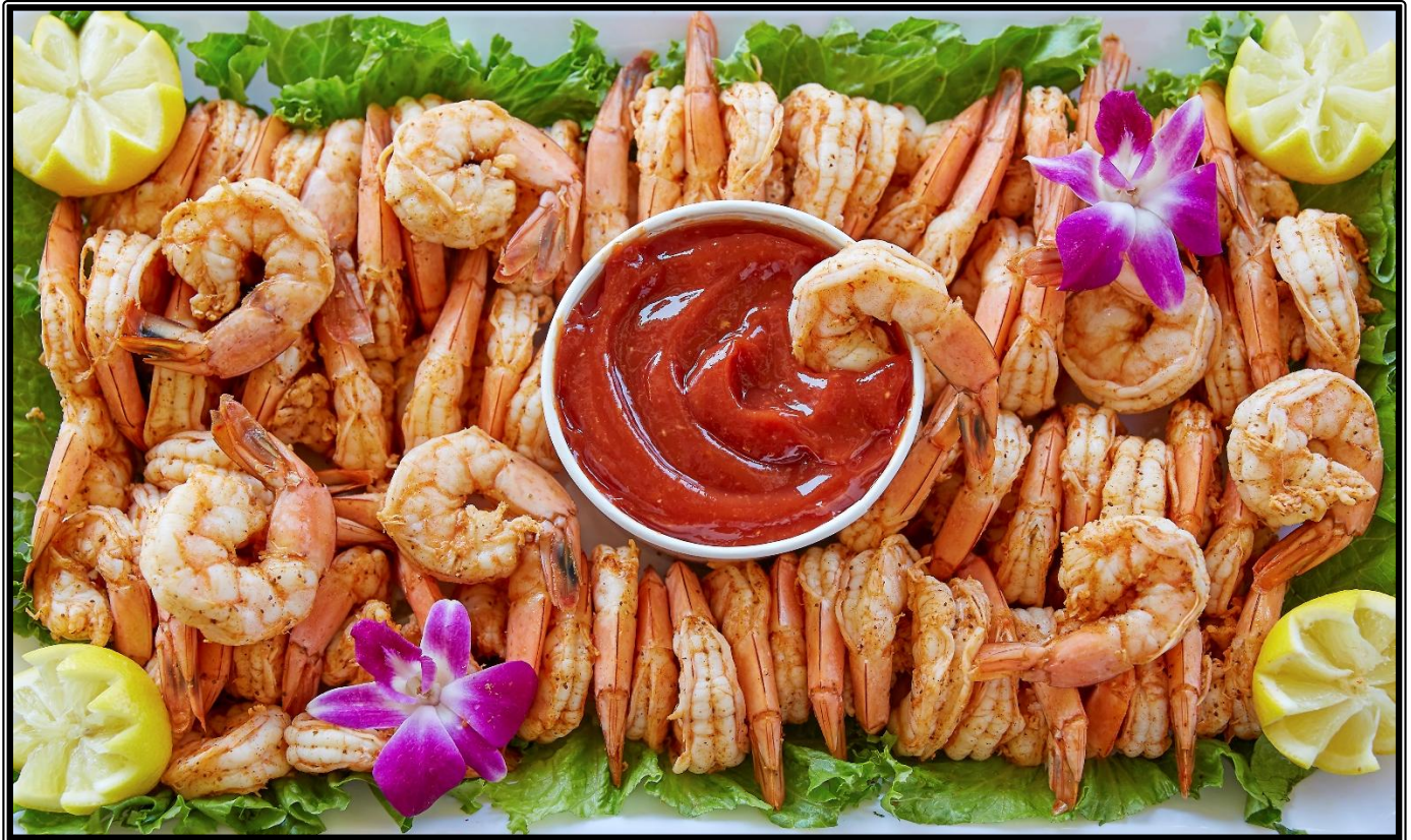
Shrimp Cocktail Platter

Medium Serves 10-15 Guests ☺ Large Serves 20-25 Guests