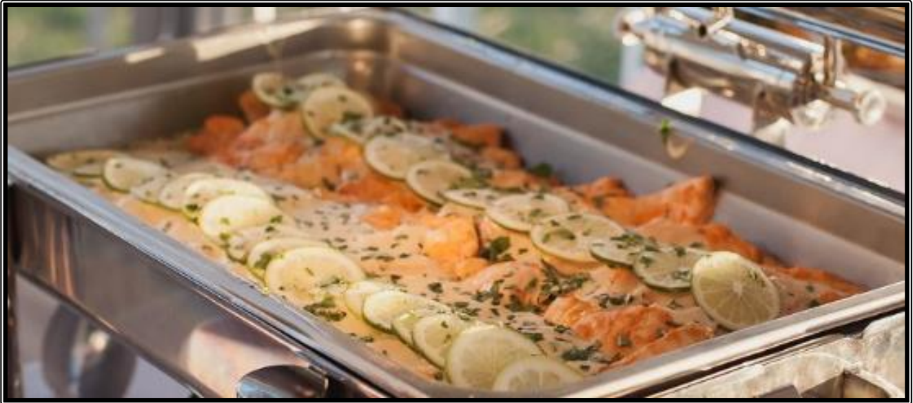
Tequila Lime Chicken