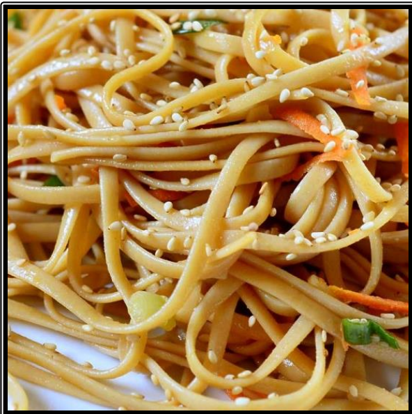
Asian Sesame Noodles

Red Bliss Potato Salad G Medium $34.95, Large $54.95