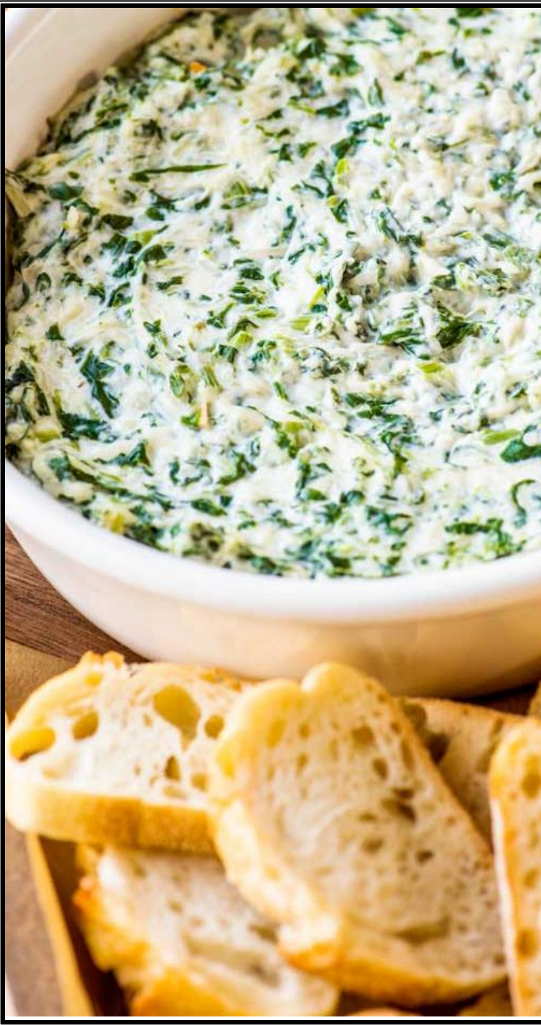
Spinach & Artichoke Dip

Fresh Spinach, Artichoke Hearts & gourmet Cheeses, Served hot with Crostini or Crudités G