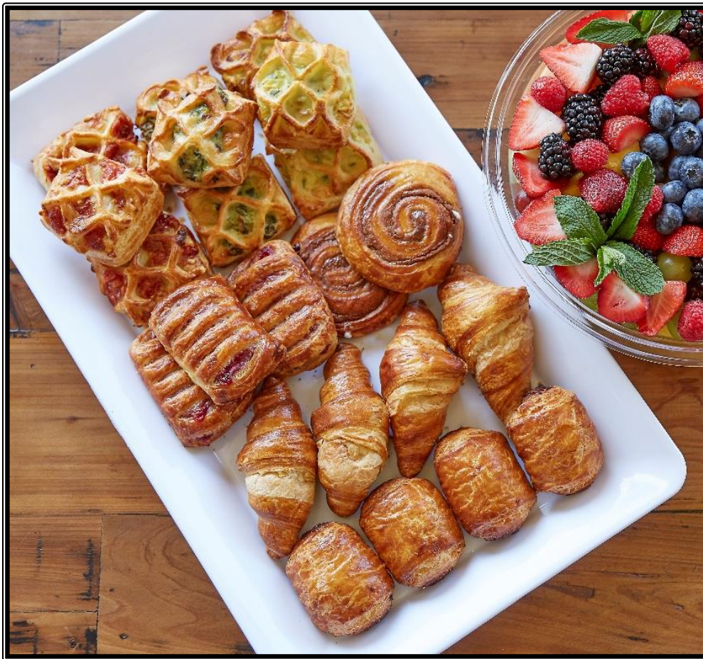
Sweet and Savory Croissants with Fruit Salad